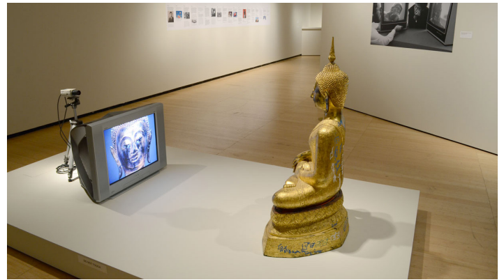
TV Buddha Nam June Paik 1989

Choose 3 artists from the list that you would be interested in learning more about. They span the gamut of styles, time frames, and artistic approaches. Bring your top 3 choices to class next time, then you will be assigned a date to give a powerpoint or keynote presentation about one artist and their work. The presentation should include at least 5 examples of their work (more is better!), basic info about the artist, and details about their work and art making practice. The presentation should focus on the artist's use of time in their work. I want you to show us examples of their art and explain why it is important, influential, and/or ground breaking. It is important you research beyond wikipedia! Go to the library. Read reviews of the artist's work. Your presentation should give us a solid understanding of your artist and the work they create.