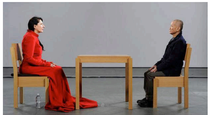
The Artist Is Present Marina Abramovic 2010